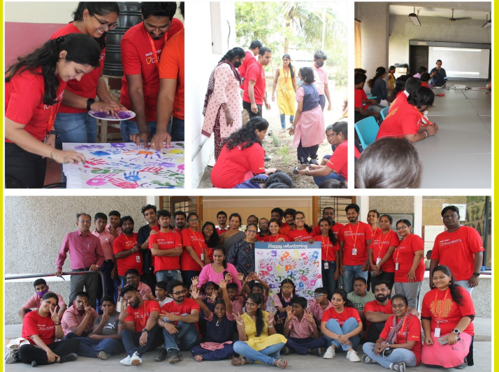
Volunteers from Wells Fargo visited SPASTN on 16th June 2022 and engaged children in "Back to School" activities